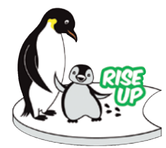
Rise Up Patch 30+ nut, chocolate and/ or magazine items