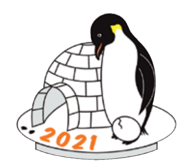
2021 Patch 10+ nut, chocolate and/ or magazine items

Rewards Rewards are cumulative and include all products!