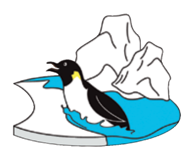
Penguin Iceberg Patch 40+ nut, chocolate and/ or magazine items