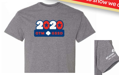
OTM T-shirt 100+ OTM packages