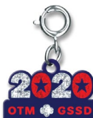
OTM charm 24+ OTM packages