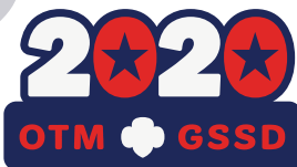
OTM patch 12+ OTM packages