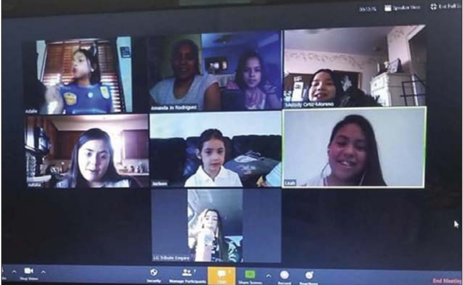
Troop 7777 participates in its first virtual meeting. In the last year, two girls moved to Texas and San Diego. Meeting virtually allowed the troop to welcome them back. The girls celebrated a birthday, took turns talking about how they have kept busy and discussed what they will do in future virtual meetings.