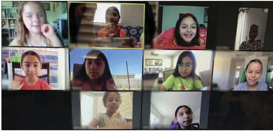
Brownie Troop 7210 meet virtually.