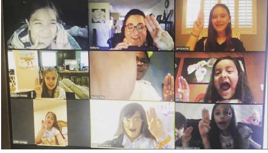
Girl Scout Troop 7905 out of Brawley say the Girl Scout Promise during their first virtual meeting recently.