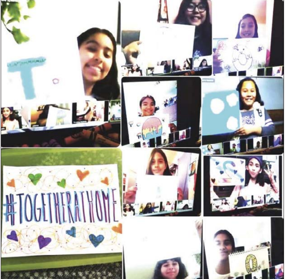
Troop 7270 work on a poster during their first virtual meeting together.