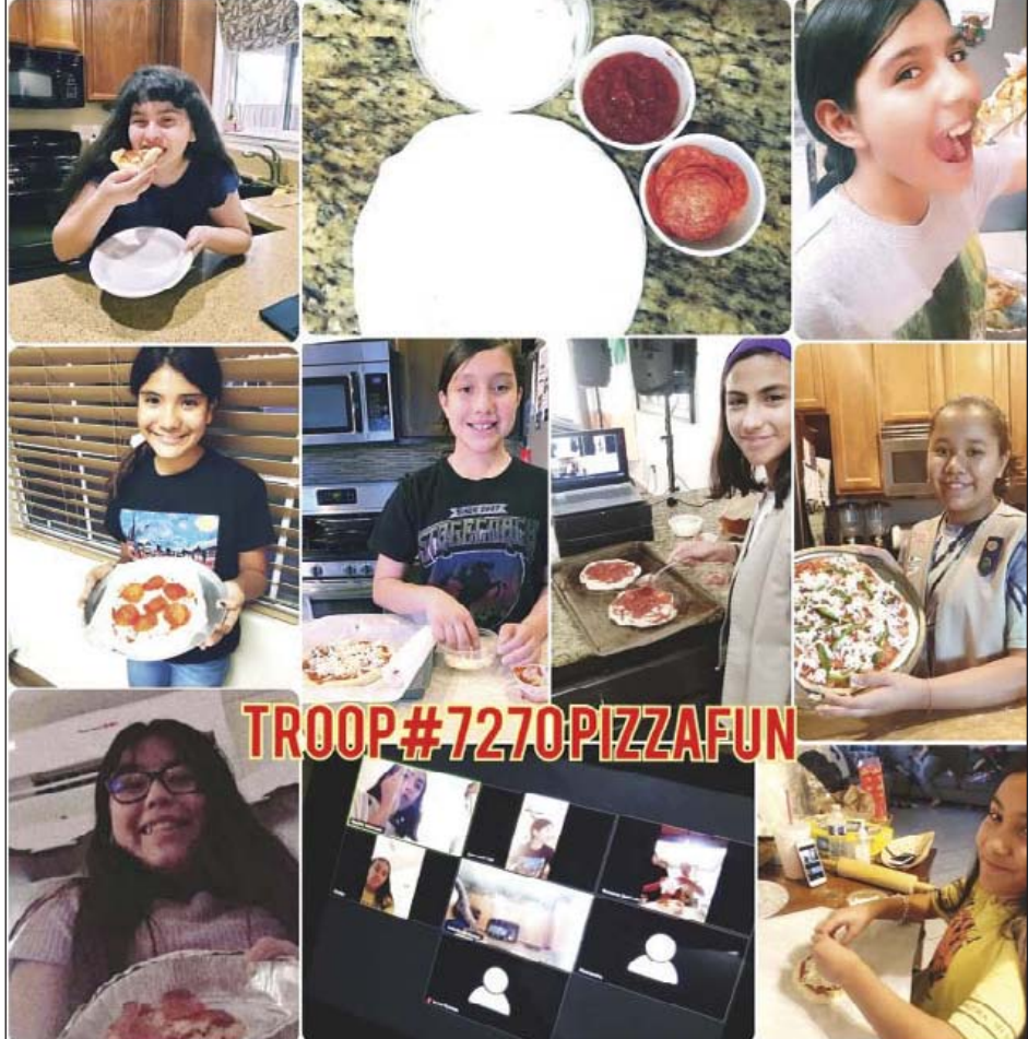
Troop 7270 made pizzas during their second virtual meeting. While they enjoyed eating their pizzas, the girls played a Kahoot! pizza quiz.