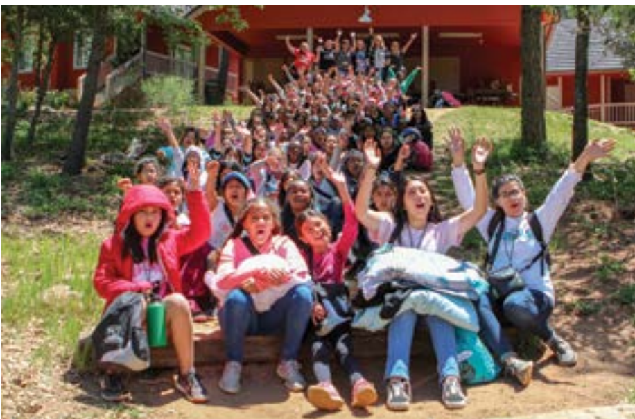
Nearly 100 girls attended Mountain Adventure Camp.

To send a girl to camp, or to learn about other ways to help fund our outdoor programs, contact Director of Development Laura Rice at 619-610-0735 or lrice@sdgirlscouts.org .