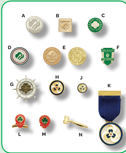
Contact your local Girl Scout Council for earning requirements.

D. USGS Overseas Pin. This pin is available to any girl or adult who is, or has been registered in a USA Girl Scouts Overseas committee. \frac{3}{4} " round. Goldtone steel with epoxy. Clutch back. Imported. 09060. $5.00.