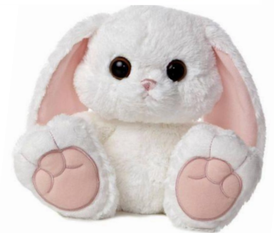
Buttercup Day Camps "I come wearing my own camp bandana!"