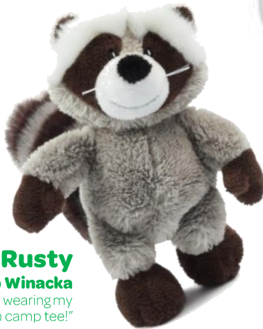
Rusty Camp Winacka "I come wearing my own camp tee!"