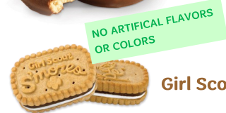
Girl Scout S'mores