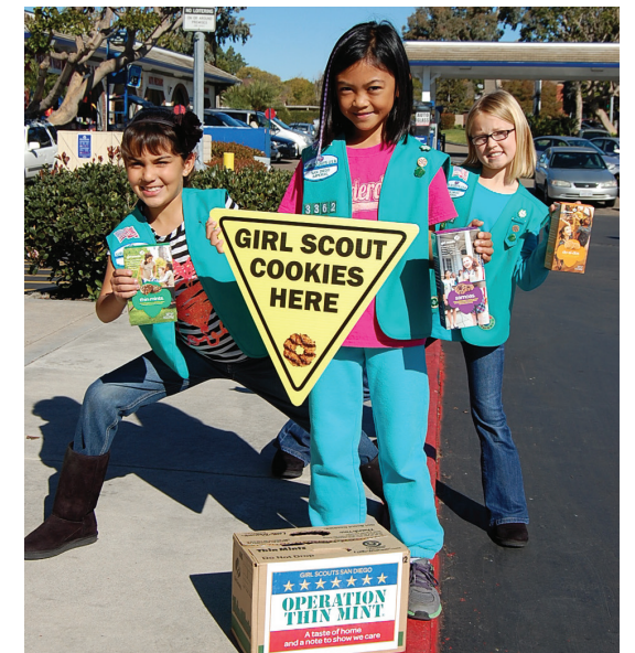
The Girl Scout Cookie Program teaches essential life skills like goal setting, decision making, money management, people skills and business ethics. It also empowers girls to build a brighter future as they earn money for events and activities that benefit them and their communities. This year, local girls sold more than 2.8 million boxes of cookies.