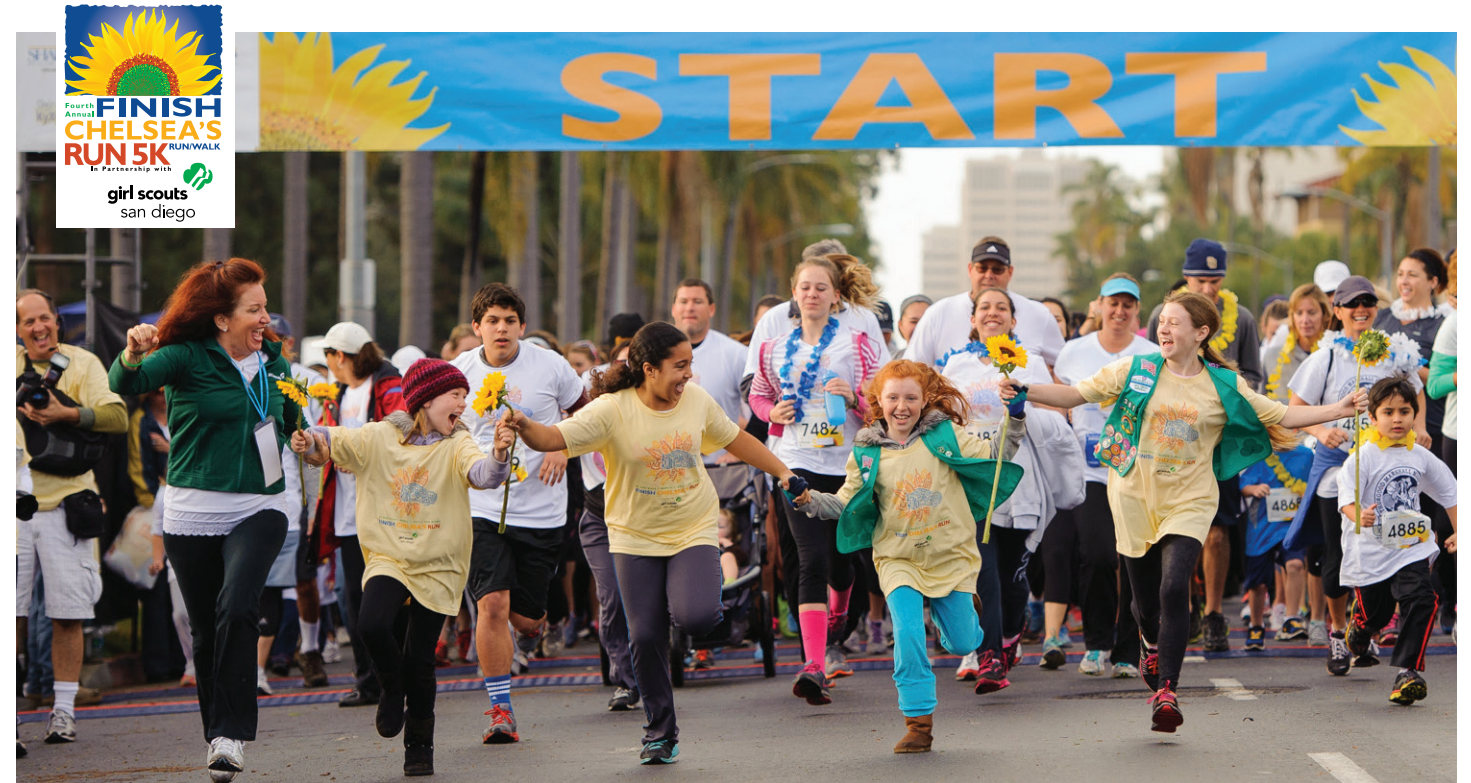
Girl Scouts San Diego's new partnership with Finish Chelsea's Run resulted in a record-breaking 6,800 participants and more than 1,200 volunteers and friends at the run on March 1. Together we are creating a powerful voice for the protection of our children, as well as the opportunity for regional high school students to earn scholarships.