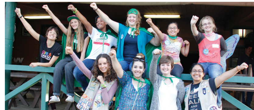
At our Save the Planet workshop, teens taught younger girls how to become "planet protectors" by harnessing the four elements of earth, air, fire and water.