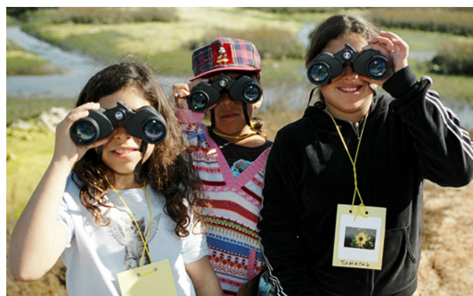
Girls' futures look brighter than ever, thanks to our sponsors.