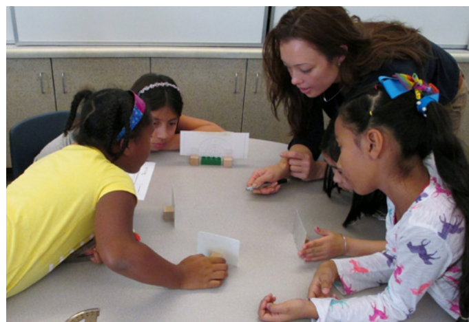
A SPAWAR volunteer guides girls as they plan how to direct a laser to a target.