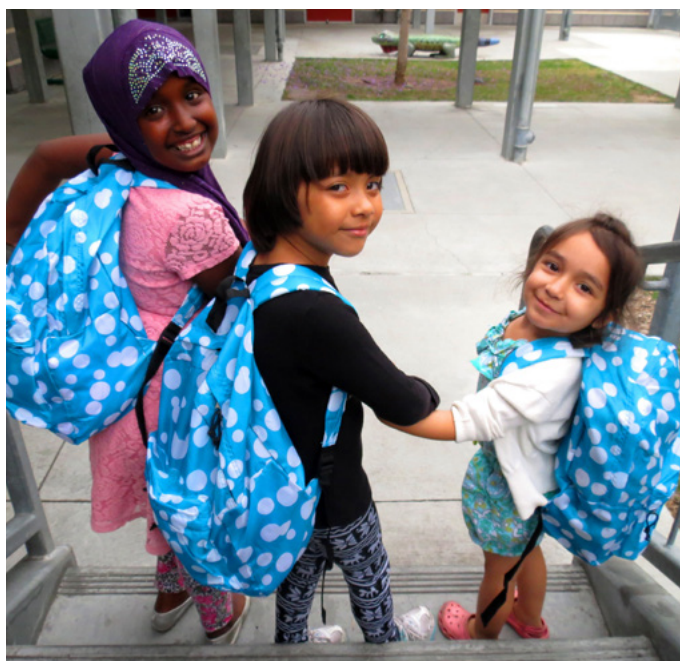
Outreach girls with their new Soroptimist-donated backpacks!